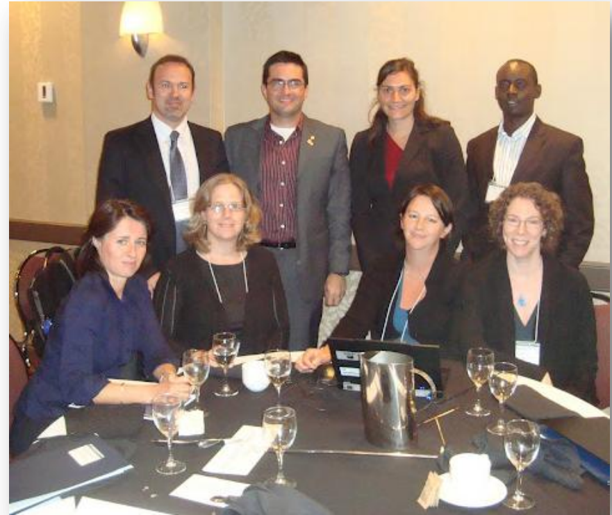
Working session on the launch of the Global Network of Environmental Prosecutors