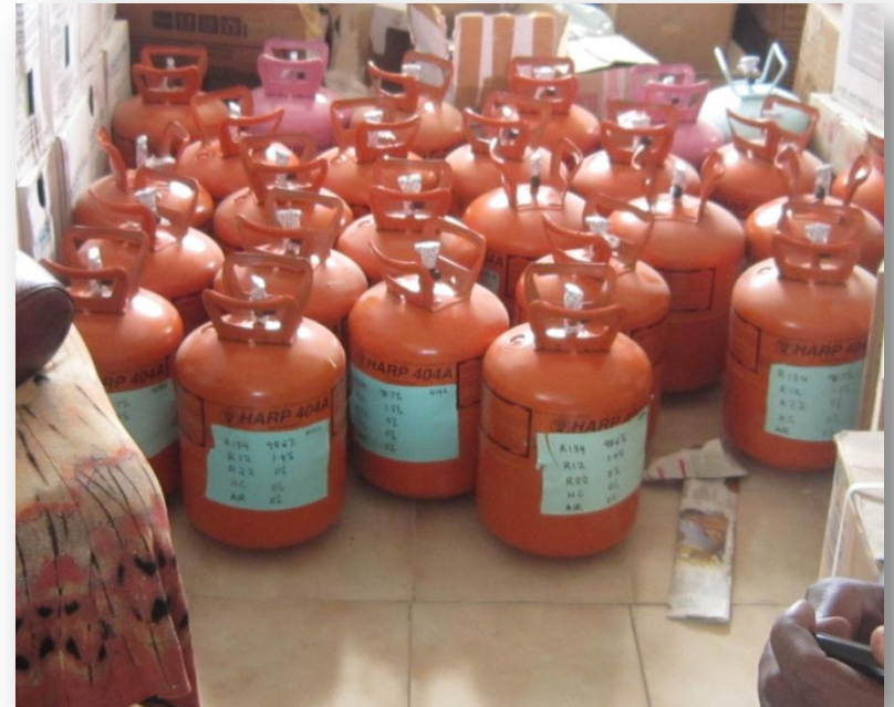
Part of the seized ODS consignment in Nairobi