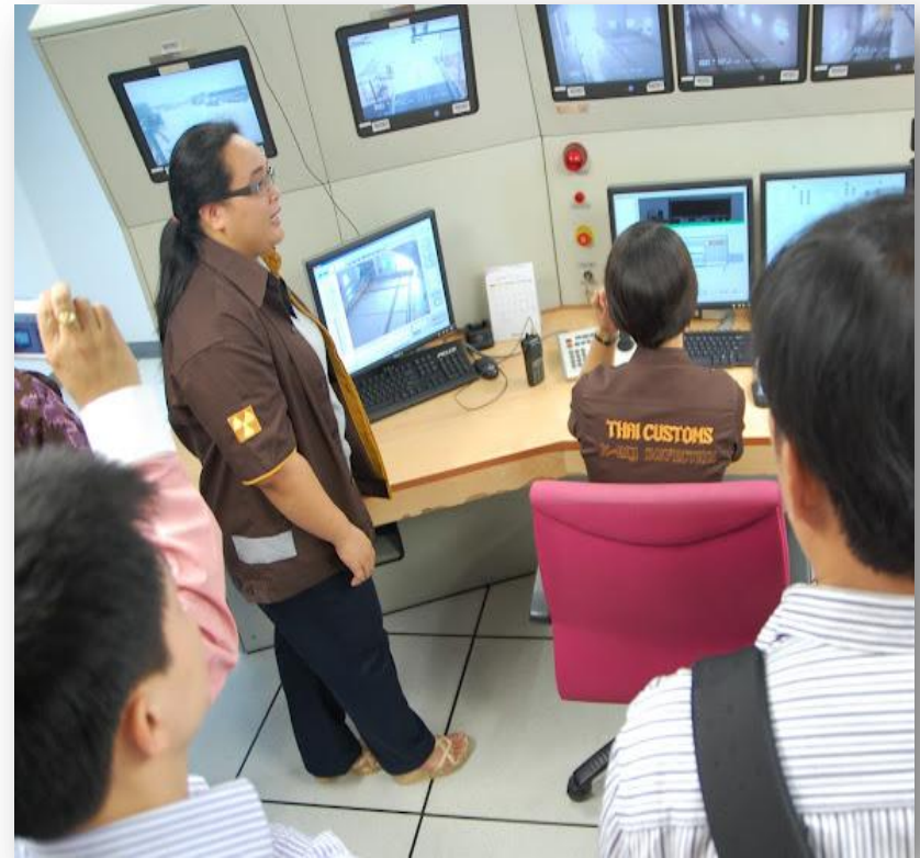
Customs officers discuss methodology with workshop participants in Thailand