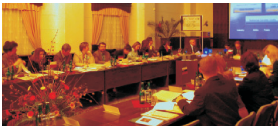
Presentation at Prague Workshop

The objective of the workshop was to identify and discuss common issues between Chemicals and Hazardous Wastes Conventions and to strengthen the co-operation among stakeholders involved in the process of implementation and enforcement in the participating countries. A series of recommendations was made on the implementation status of the concerned Multilateral Environmental Agreements in the participating countries, on the transboundary movements of relevant waste streams (PCBs, POPs, ODS, etc.) in the region and on the prevention, detection and monitoring of illegal traffic of these waste streams. Further discussed were the