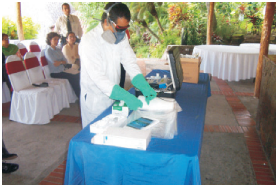
Demonstration at El Salvador workshop, electronic probe for PCB analysis

Vincent.Jugault@unep.ch Tel. +41 (0) 22 917 82 23