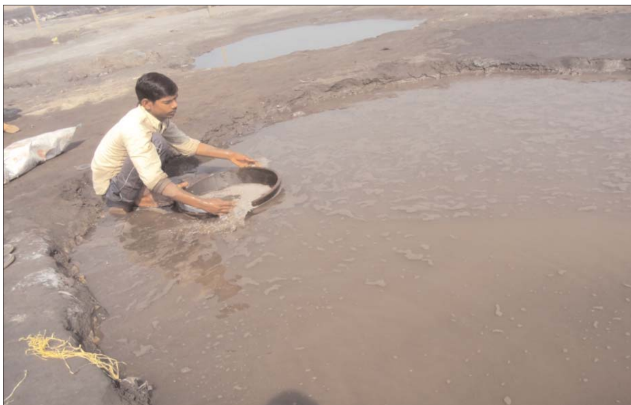
Workers washing the ash to recover fragments of metals on the banks of the Ramganga, Moradabad