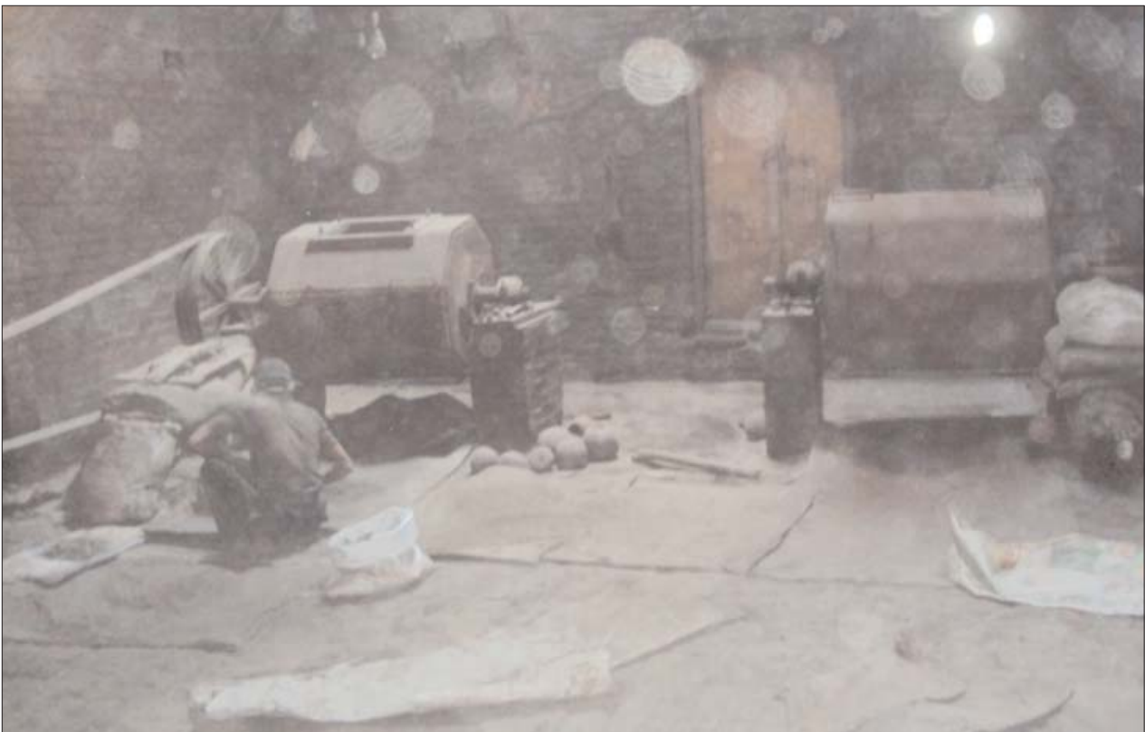
Ball mill in operation at Nawabpura, Moradabad. The area was very smoky, hence the picture quality