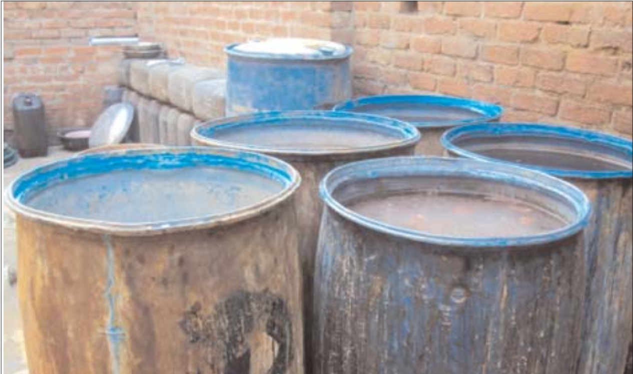
Containers with acid kept in a household for metal recovery, Nawabpura, Moradabad