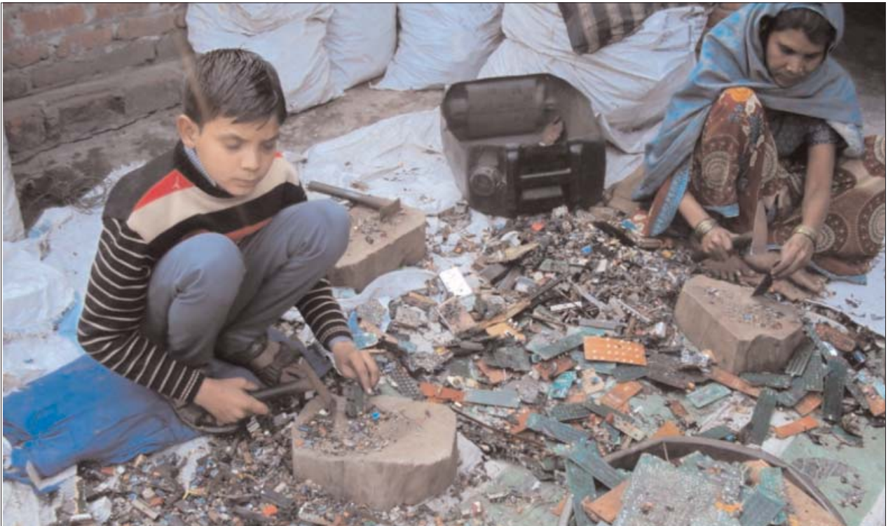
Children segregating components from PCBs, Bhojpur