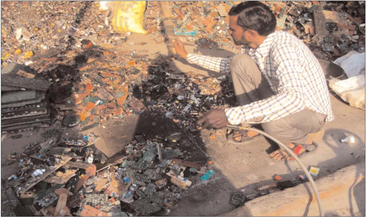
A worker using blow torch/flame to loosen the soldering of a PCB, Bhojpur