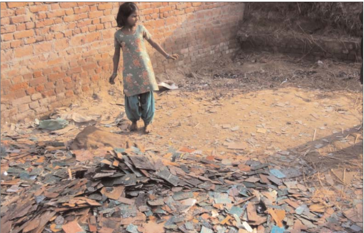
Streets littered with PCB waste, Bhojpur