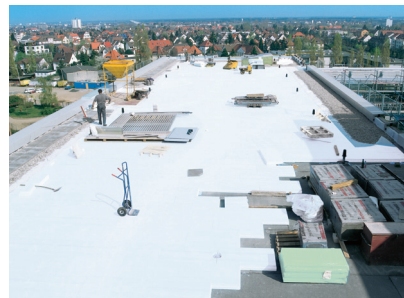
Figures 1a and 1b: Examples of uses of PS foam in insulation: XPS and EPS.

XPS and EPS respectively. Almost all XPS and EPS insulation boards for the building and construction markets, where fire-retardant properties are required, contain the flame-retardant HBCD, which has a very high Br content of 74.7 wt%. The actual level of the HBCD content depends very much on the application and the country. Different flame-retardant testing methods and requirements exist in Europe and hence various HBCD levels exist in the market. It is estimated that 77 % of EPS and 94 % of XPS in construction markets is flame-retarded.